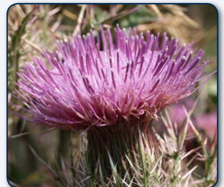
Thistle ( Cirsium spp.) ( Cirsium species often can be difficult to control.)