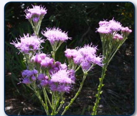
Florida paintbrush ( Carphephorus corymbosus )