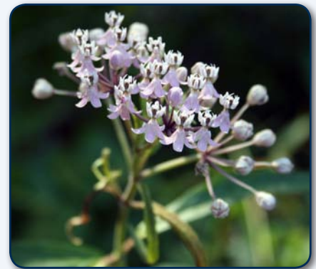
Swamp milkweed ( Asclepias incarnata )