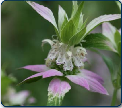
Dotted horsemint ( Monarda punctata )