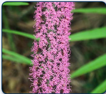
Blazing star ( Liatris spp. )