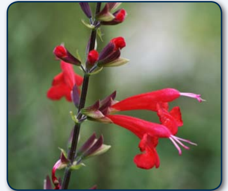
Tropical sage ( Salvia coccinea )