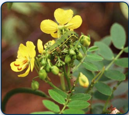
Bahama cassia ( Senna ligustrina ) with cloudless sulphur butterfly caterpillar