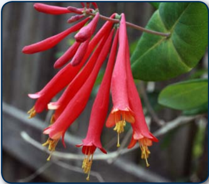
Coral honeysuckle ( Lonicera sempervirens )