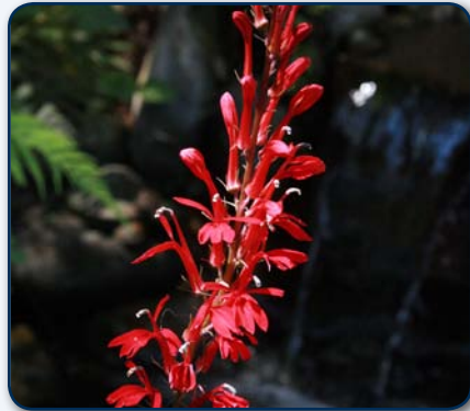
Cardinal flower ( Lobelia cardinalis )