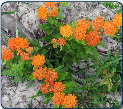
Butterfly milkweed ( Asclepias tuberosa )