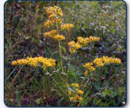
Goldenrod ( Solidago spp.)