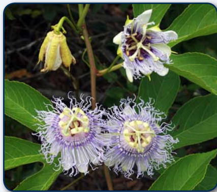
Passionvine ( Passiflora incarnata )