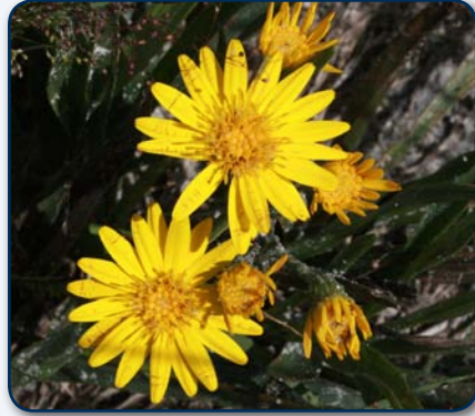
Grassleaf goldenaster ( Pityopsis graminifolia )