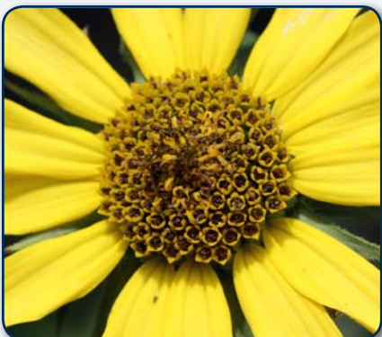
Sunflower ( Helianthus spp.)